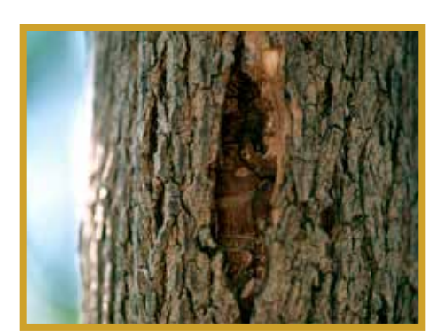
Figure 21. Vertical splits in the bark are another sign that EAB has infested the tree.