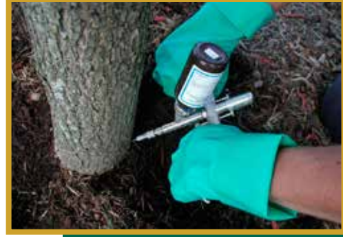
Figure 25. A syringe-like applicator is used to inject imidacloprid to control EAB. Photo: David Cappaert, Michigan State University*