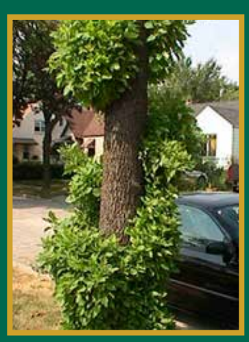
Figure 17. New sprouts grow on the lower trunk of an ash tree infested with EAB.