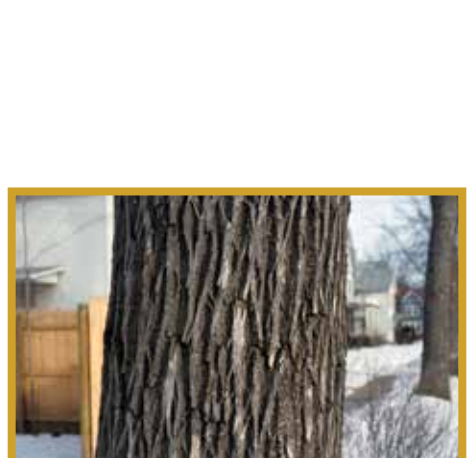
Figure 12. The bark on mature ash trees has diamond-shaped ridges.