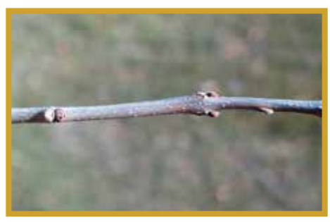
Figure 15. The buds on ash trees grow in pairs, directly opposite from each other.