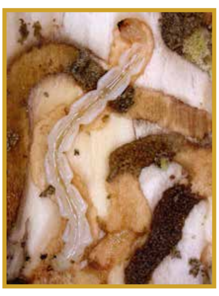
Figure 7. Emerald ash borer larva.