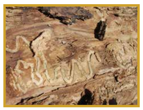
Figure 22. S-shaped tunnels or galleries can be found under the bark of an infested ash tree.