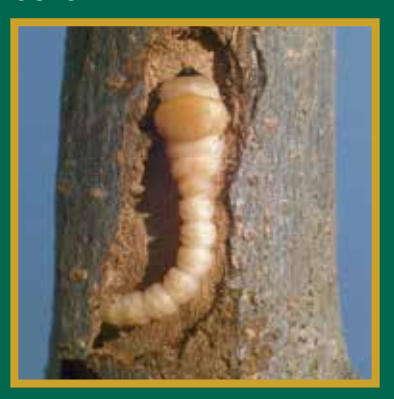
Figure 5. Dead and dying branches on ash trees may be infested with the flatheaded appletree borer.