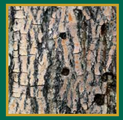
Figure 3. When lilac/ash borers exit an ash tree, they create irregular round holes.