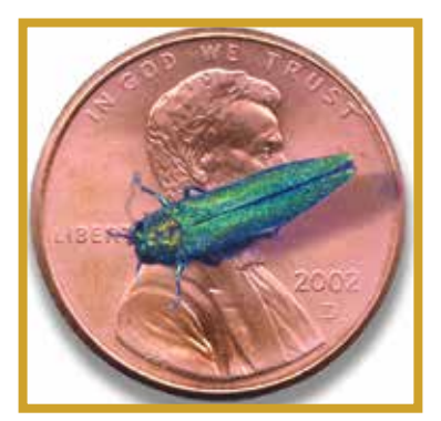
Figure 8. Adult beetles can fly approximately a half-mile to infest a new tree. Photo: Howard Russell, Michigan State University*