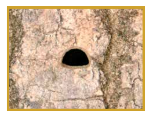
Figure 19. D-shaped exit holes can indicate the presence of EAB.

If an ash tree is experiencing dieback or appears unhealthy, have it examined by a professional. Landowners that suspect the presence of EAB in their ash trees should visit the website <a href="www.eabcolorado.com">www.eabcolorado.com</a>, contact the Colorado Department of Agriculture (CDA) at (888) 248-5535 or send an email to <a href="mailto:CAPS.program@state.co.us">CAPS.program@state.co.us</a>.