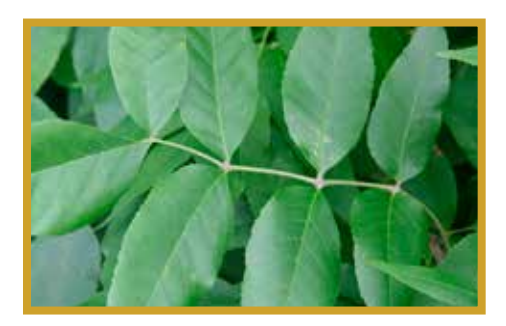
Figure 11. Ash trees have five to nine leaflets on each stalk. Photo: Robert Vidéki, Doronicum Kft.*