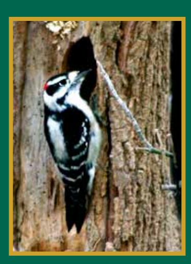
Figure 18. Woodpeckers are an important predator of EAB.