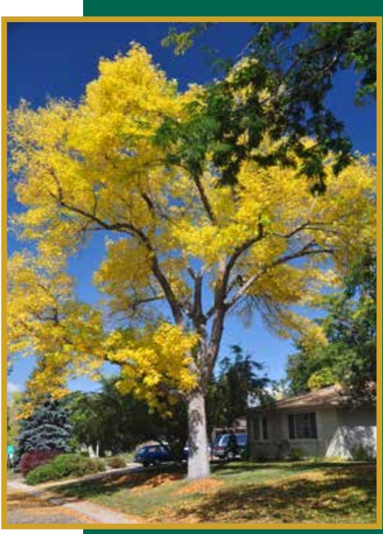
Figure 10. Ash trees have been planted extensively in Colorado over the last 50 years because they grow quickly and can tolerate the growing conditions in urban areas.