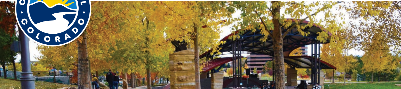
Centennial Center Park Amphitheater